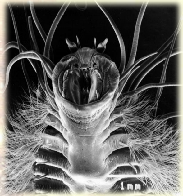
Methane Ice Worm.

In determining the location selection for a SRF, no official policy exists. However, there have been several reports that recommended parameters for SRF location selection. The following criterion is largely based on those reports: